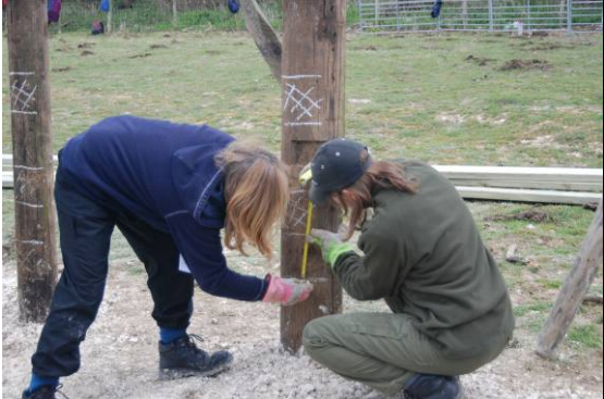
Rail positions are marked on the posts.