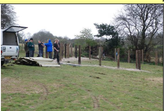
Looking a little Neolithic after post-hole digging continued for another week. Now the planking for the corral rails arrives on site.